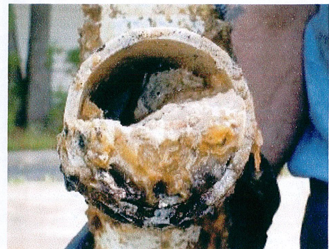
Example of a Grease clog in a sewer pipe

When grease washes down the sink, it sticks to the insides of the pipes that connect your home or business to the township's sewer. It also coats the insides of the township's sewer pipes.